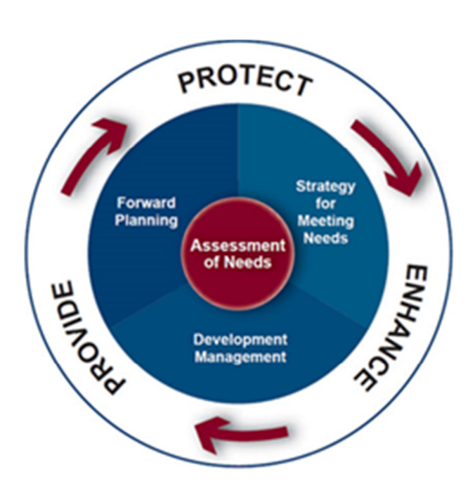
Figure 1: Sport England themes

To provide new outdoor sports facilities where there is current or future demand to do so.